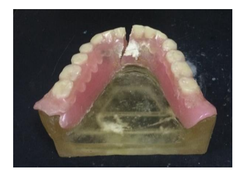
Fig 3: The experimental denture under load applicator of the universal testing machine, (b) denture fracture

The strain gauges were attached at the mesial and distal aspect of the implant, Since it is not feasible to measure the moments generated at an implant directly, it was assumed that strain measured on the resin around the implants could be representative of stress that is introduced to the bone. Therefore, two grooves were created below the crest of the ridge parallel to the long axis of the implant leaving 1mm of resin intact [24]. Then, four linear strain gauges (type: KFG-1-120-C1-11L1M2R; KYOWA electronic instruments CO., Ltd., Tokyo, Japan; resistance 119.6 \pm 0.4% \Omega ; gauge length: 1mm; gauge factor: 2.08 \pm 1.0%) were bonded to the acrylic resin at mesial and distal surface of each implant using a Cyanoacrylate adhesive (TML strain gauge adhesive, Tokyo Sokki Kenkyujo Co Ltd, Japan)